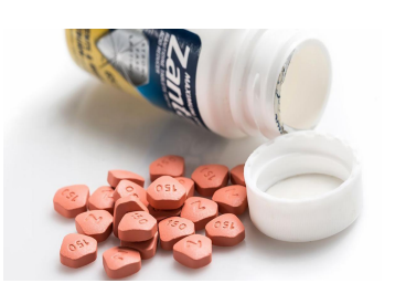
Zantac Class Action