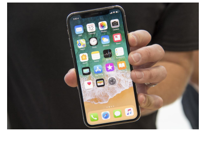
Apple Smartphone Class Action