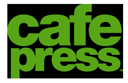
CafePress Class Action