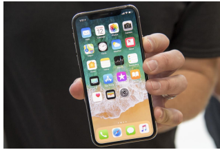
Apple Smartphone Class Action