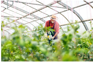
Roundup Class Action