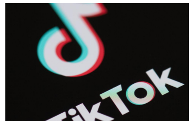
TikTok Class Action