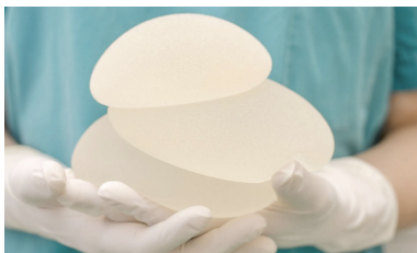
Allergan Class Action