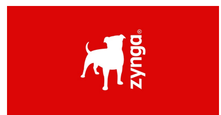
Zynga Class Action