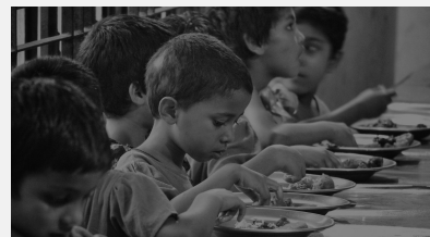
First Love Ministries