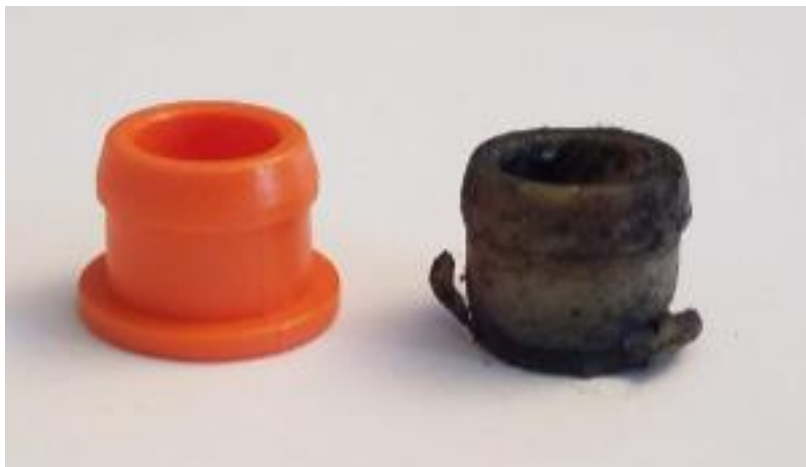
New Defective Bushing (left); Defective Bushing removed from a 2015 Ford Transit Connect after less than four years of use (right) 19

54. Over time, the Defective Bushings degrade and eventually detach from the shift cable.