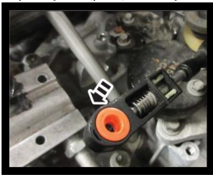
A Class Vehicle shift cable shown with shift cable bushing in place 18